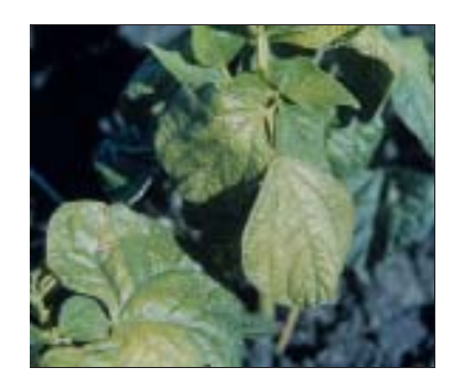
Figure 2. Zinc deficiency in pinto beans.

Foliar applications of zinc chelate products when the plants are small also have been used effectively. Do not to apply foliar zinc products with herbicides or other plant protection products because of the chance of increased phytotoxicity to the crop or decreased efficacy to the pest.