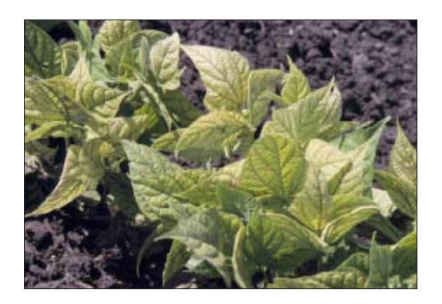
Figure 3. Iron deficiency chlorosis on a saline, calcareous soil near Arthur, N.D.

Iron fertilizer sprays are available, but have not alleviated the problem consistently. The severity usually is caused by wet soil conditions that increase soil bicarbonate levels. As soil dries, bicarbonate levels drop and affected plants usually green up. If a field has a known susceptibility to iron deficiency chlorosis, selecting varieties that have shown more tolerance to the conditions is recommended.