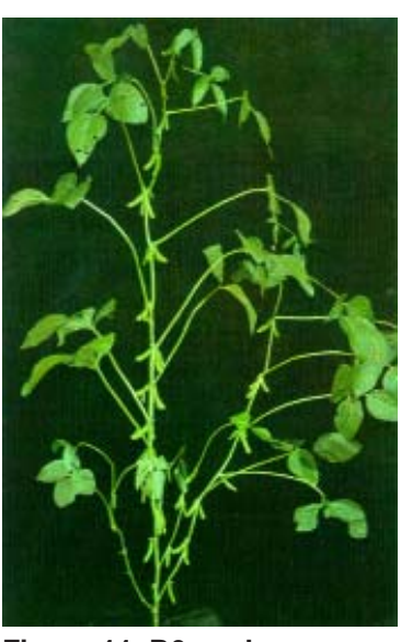
Figure 11. R6 soybean.