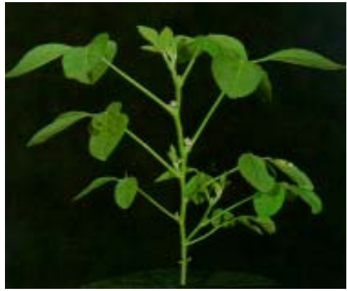
Figure 7. R2 soybean.