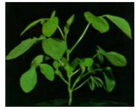
Figure 5. V6 soybean.

Soybeans are often 12 to 14 inches tall at this stage with seven nodes with unfolded leaflets. The unifoliolate and cotyledons may have senesced from the plant. New stages are quickly unfolding every two to three days. Lateral roots have crossed over the row underground in any rows 30 inches or less. The plant is still capable of recovering from damage; a 50% leaf loss at this stage will only affect yield about 3%.