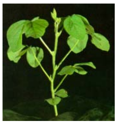
Figure 4. V5 soybean.

Soybean plants are about 7-9 inches tall with four nodes (three unfolded leaflets) at V3 and will be about 10-12 inches tall with six nodes of unfolded leaflets at V5. The number of branches seen on the plant may increase at this point in wider row spacings and under lower plant densities, depending upon variety grown. Up to six branches are normally developed under field conditions in branched (rather than upright) varieties with the largest branch being the main stem. At V5, the plant normally has axillary buds in the top stem that will develop into flower clusters (racemes). V5 is about one week from R1 or first flower. At V5, the total number of nodes that the plant can produce is established. With indeterminate soybeans, this total is higher than the number of nodes that will actually fully develop. However, these extra axillary buds allow the plant to recuperate from any hail or wind that may damage some of the buds. Although the stem apex (main growing point) is dominant, damage to this growing point will allow axillary buds lower on the plant to suddenly branch and grow profusely. Thus, soybeans are capable of producing new branches and leaves after hail destroys almost all the above ground foliage as long as some (at least one) axillary buds remain intact. If the plant is broken off below the cotyledonary node, however, the plant is killed as no axillary buds are below this node.