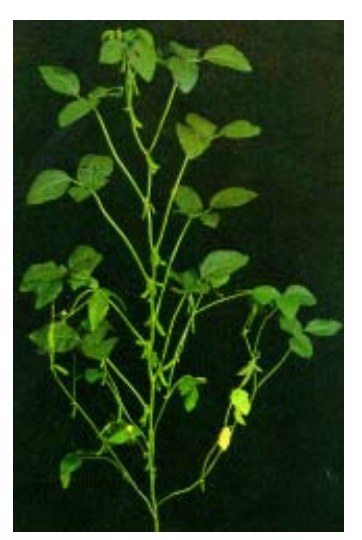
Figure 10. R5 soybean.