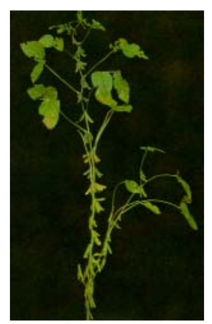
Figure 12. R7 soybean.