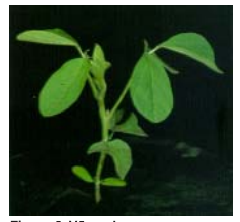
Figure 3. V2 soybean.

Plants are 6-8 inches tall and have three nodes with two unfolded leaflets. Active nitrogen fixation from the bacteria is just beginning to occur. Most of these root nodules are within 10 inches of the soil surface with millions of bacteria in each nodule. Nodules that are pink or red inside are active in nitrogen fixation. White, brown or green nodules are not efficiently fixing nitrogen and are probably parasitic on the plant. A minimal amount (50 pounds of nitrogen in North Dakota and the Red River Valley of Minnesota, no addition in the rest of Minnesota) of nitrogen fertilizer can be supplied to soybeans as a starter fertilizer. The plant will use bacteria-produced nitrogen and the applied or intrinsic soil nitrogen. Too much nitrogen fertilizer will cause the plant to use this supply rather than develop nodules and fix nitrogen. The top 6 inches of soil have soybean lateral roots developing rapidly now. Any cultivation for weed control should be no deeper than absolutely necessary to minimize root pruning.