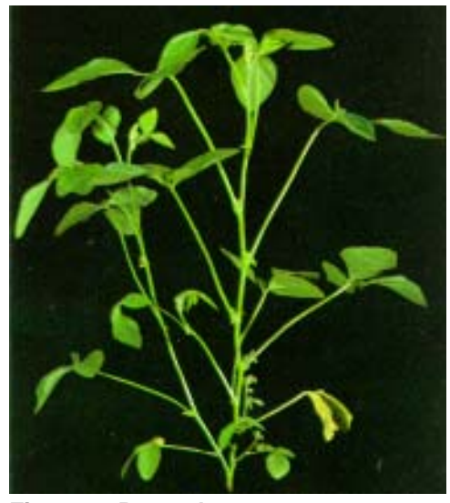
Figure 8. R3 soybean.