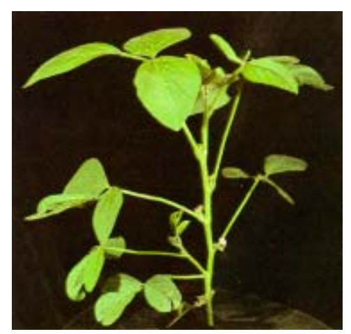
Figure 6. R1 soybean.