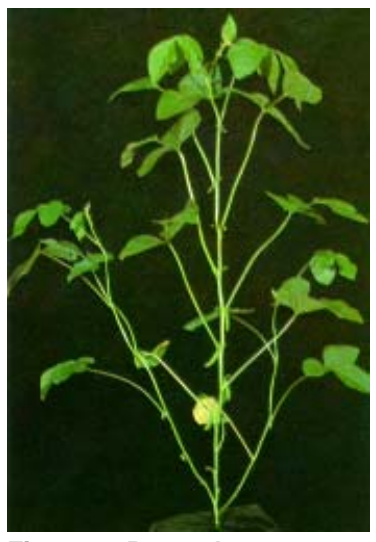
Figure 9. R4 soybean.

This stage is also known as the "green bean" stage or beginning full seed stage, and total pod weight will peak during this stage. Growth rate of the beans is rapid but will slow by R6.5 and peak at R7. This stage initiates with a pod containing a green seed that fills the pod cavity on at least one of the four top nodes of the main stem. Rapid leaf yellowing will begin right after this stage until R8, or all leaves have fallen. Within this stage, three to six trifoliolate leaves may fall from the lowest nodes on the plant prior to leaf yellowing. Root growth is complete at around R6.5 .