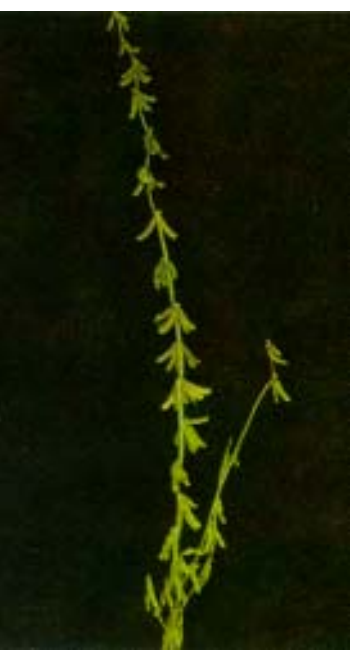
Figure 13. R8 soybean.