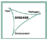
Figure 1. The disease triangle — disease develops only when all three factors are favorable. ( 4KB illustration )

Three factors interact to produce disease; the host, the pathogen, and the environment (Figure 1). If any one of these three factors is unfavorable or missing, disease will not develop. For example, the flax rust pathogen attacks only flax as a host, and different races of flax rust attack different varieties of flax. Flax rust develops only when a suitable combination of rust race (pathogen) and variety (host) interact under environmental conditions favoring this disease. The environment often limits disease in North Dakota and is the reason that some diseases rarely occur and others occur sporadically. Many diseases are favored by humid or rainy weather and may be more common and severe in years favoring good crop production.