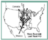
Figure 4. Long distance spread of wheat stem rust and wheat leaf rust spores from their overwintering areas. ( 8KB illustration )

Wind disseminates fungus spores from plant to plant in a field or across fields. Pathogens such as the wheat leaf rust, wheat stem rust, and barley stem rust pathogens are spread long distances by the wind (Figure 4). Leaf rust is wind-borne from the major winter wheat areas of Kansas, Nebraska and Oklahoma (Occasionally it survives the winter in North or South Dakota). Stem rust is wind-borne from Mexico and Southern Plains states to wheat and barley crops in the Northern Great Plains.