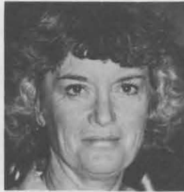
Lt. Gov. Dick

Speaking before the 22nd Annual Convention of the Colorado Water Congress, Dick called the prospect of coal, uranium, oil shale, and recreational development facing Colorado "exciting."