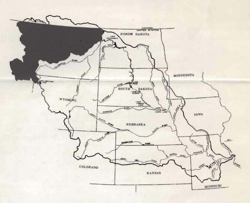
Upper Missouri River Basin study area

When developed and approved by MRBC, the proposals will be returned to the U.S. Water Resources Council to be considered for implementation.