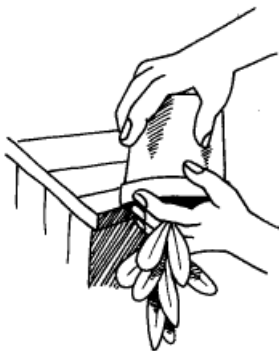
Figure 2. Removing plant from container.

Plants which are pot bound may wilt because the roots are strangling each other. Don't be afraid to remove the plant from the pot and examine the roots to see if they are too dry, too wet or diseased. To remove, merely invert the plant and lightly tap the edge of the container on a solid object while holding the plant and soil ball (Figure 2). You may find the soil mass is completely enveloped in roots and the plant needs repotting.