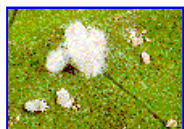
Figure 5. Citrus mealybug.

Control of mites, mealybugs, whiteflies, scales and aphids can be a problem indoors because of the difficulty in applying insecticides to the target area. For treating smaller plants, place them in a 20 to 30 gallon tightly closed plastic bag for 12 to 24 hours with a no-pest-strip insecticide. Repeat at weekly intervals for about three treatments and then repeat at intervals of a month or two. The active ingredient in the no-pest-strip, vapona, can be quite toxic, so be sure to read all label precautions before using. It is difficult to attain a complete eradication. Do not treat velvet plants ( Gynura ), Boston ferns and their varieties, zebra plants ( Aphelandra ) and Peperomias because of possible injury.