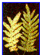
Figure 3. Soluble salt injury on fern.

Unnaturally small pale leaves and spindly plants are most generally the result of insufficient light. This is especially common during the winter or when outdoor or greenhouse grown plants are brought into the home. Small leaves might also indicate a need for fertilizer.