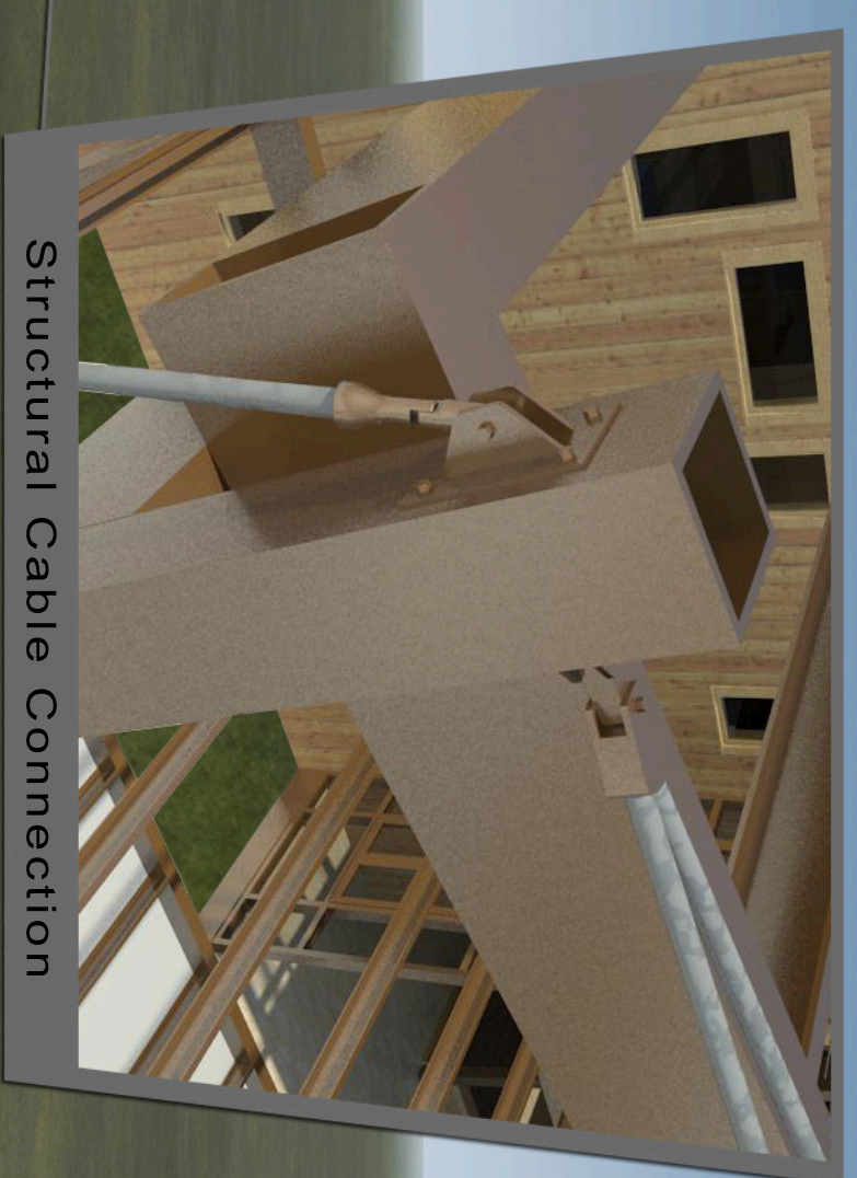
Structural Cable Connection