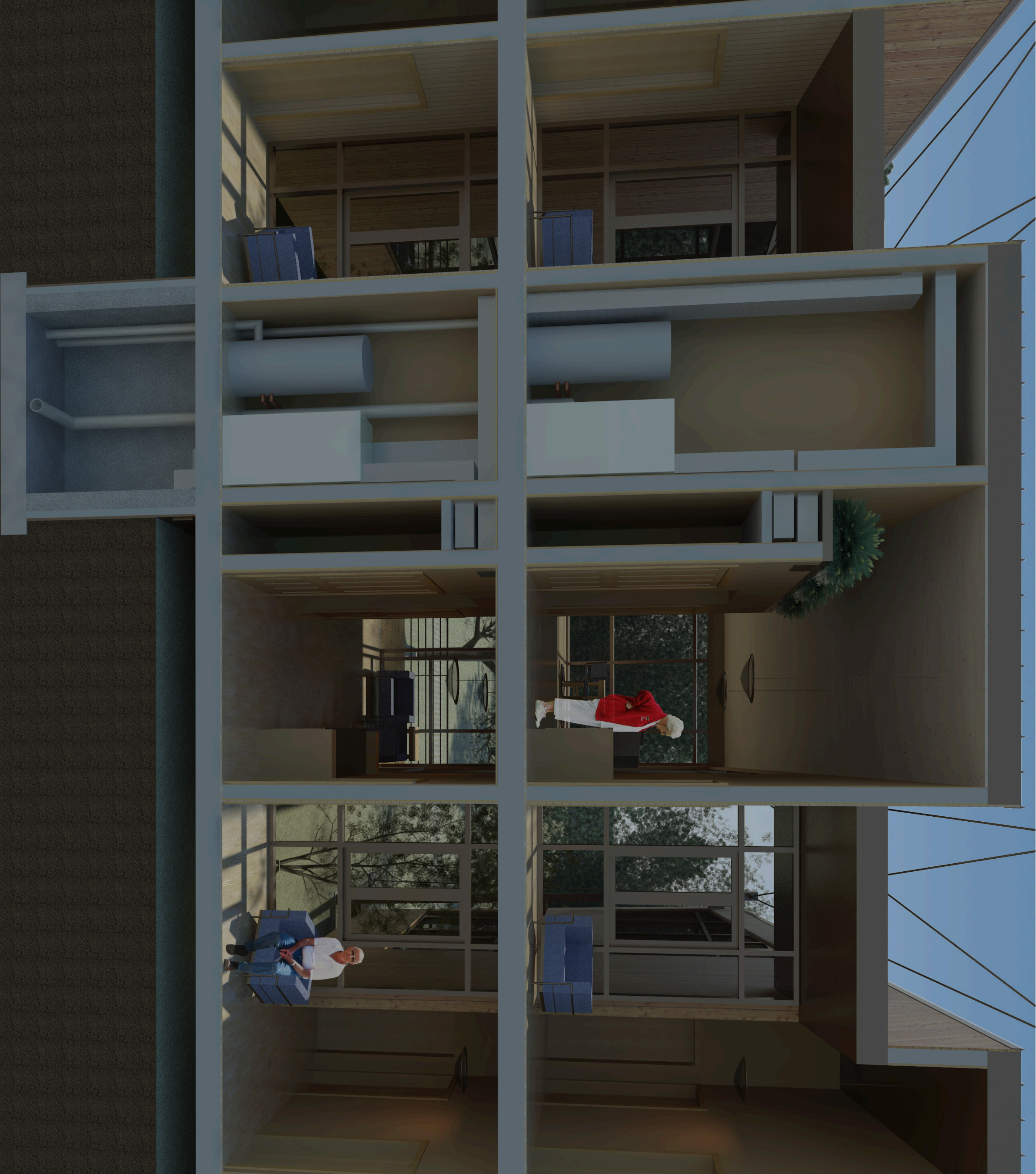
Localized Mechanical System