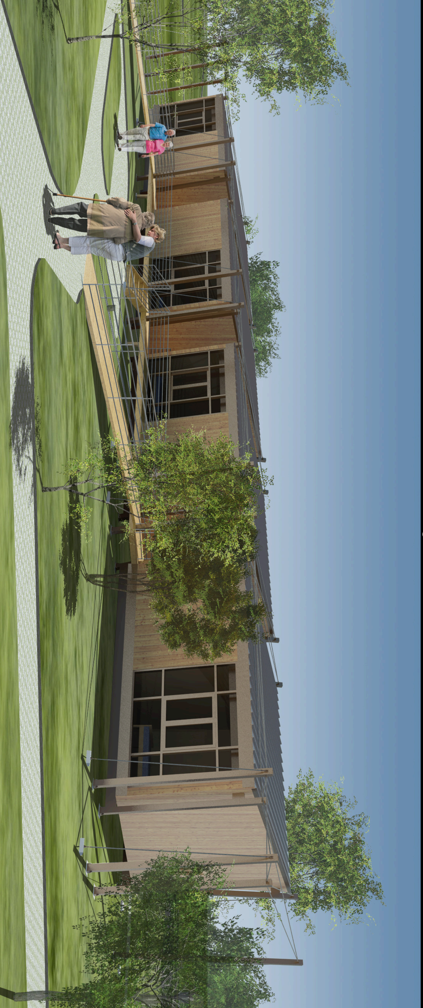
Assisted Living Units