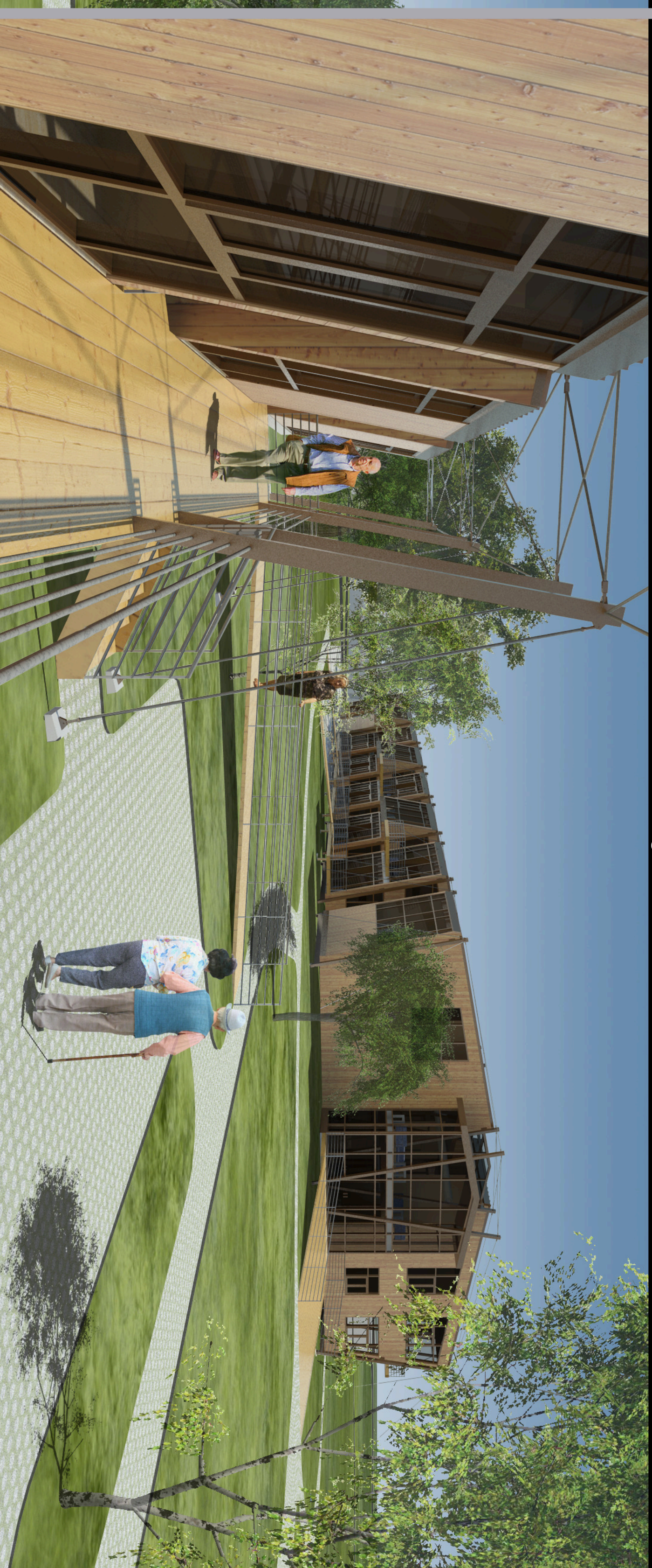
Assisted Living Units