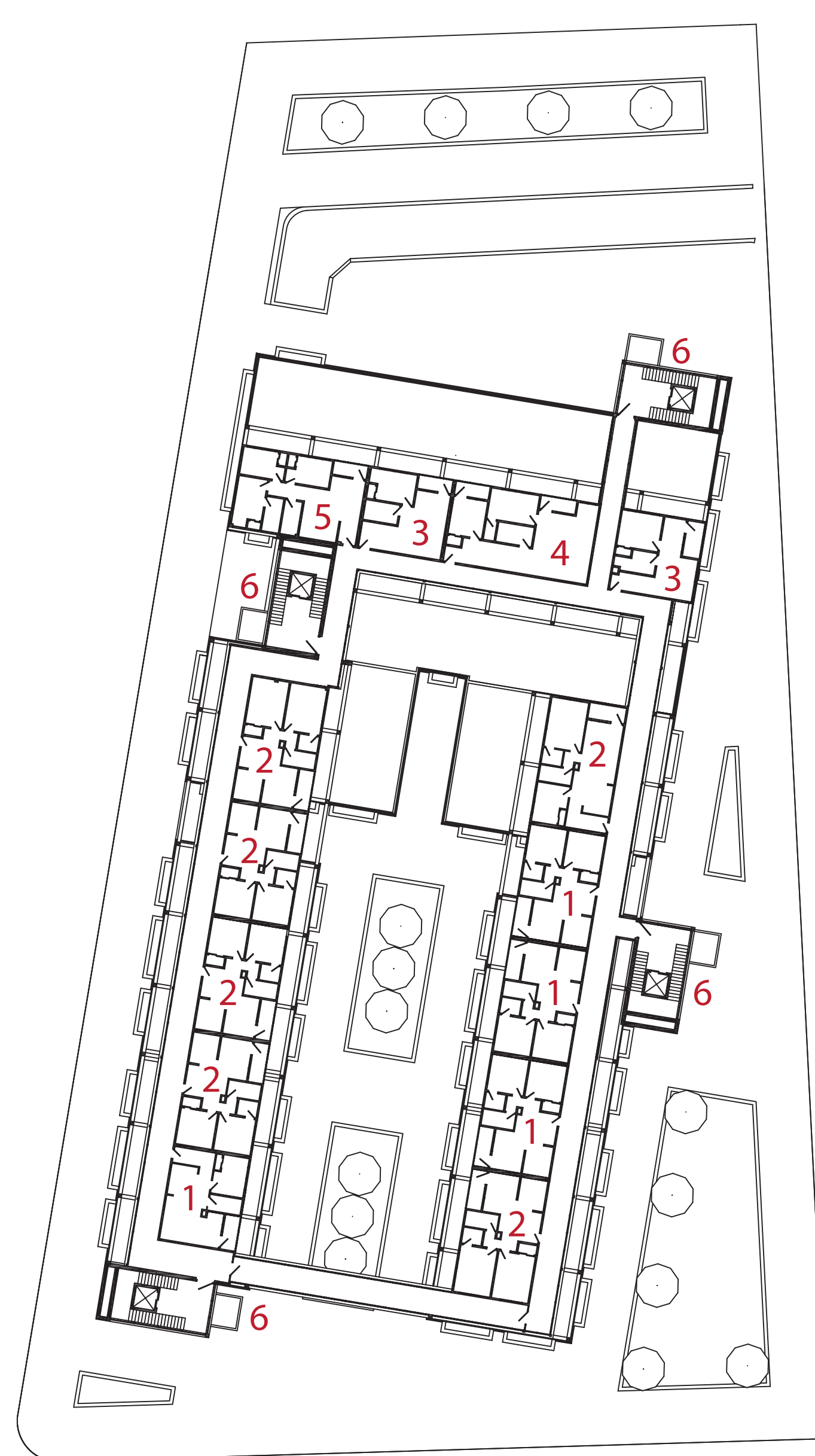
Apartment Floor Plan Scale: 1/32" = 1'-0"