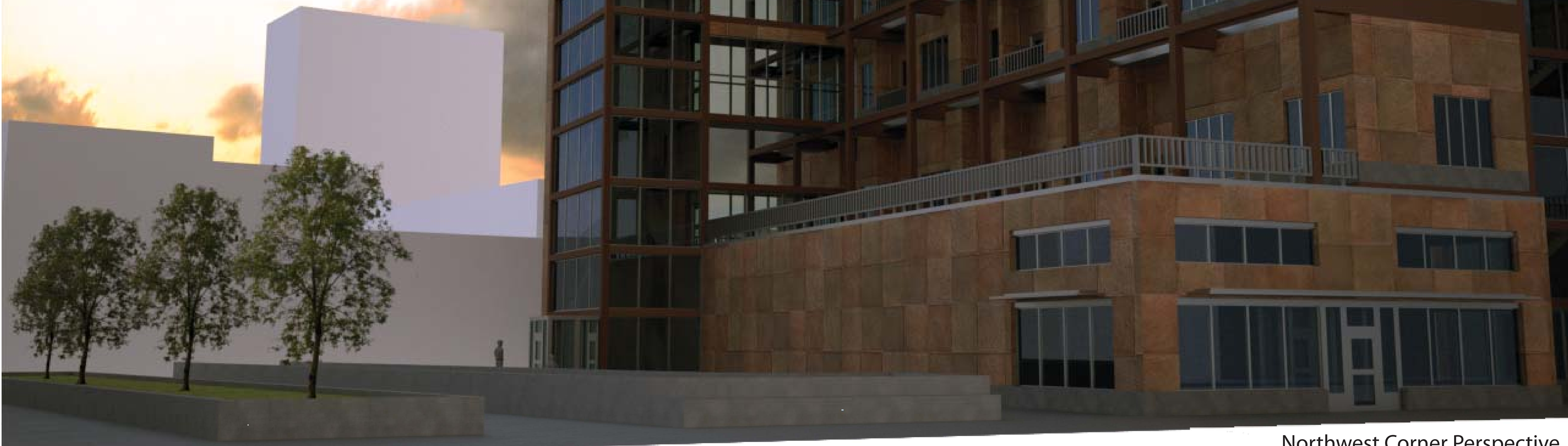
Northwest Corner Perspective

The site offered a new plot shape then the long and linear ones of the current Fargo landscape. This unique site really helped to shape the building and its structure.