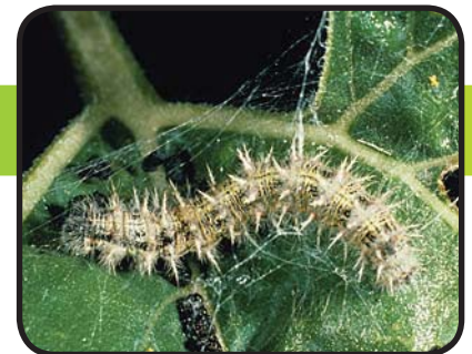
Figure 23. Thistle caterpillar (Painted lady butterfly) larva - Vanessa cardui (L.)