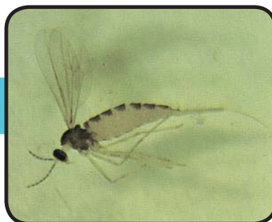
Figure 38. Sunflower midge adult - Contarinia schulzi Gagné (Extension Entomology)

Management: Since plants are susceptible throughout the bud stage, and several emergence events of adult midges occur, correct timing of insecticide for adult midge control is difficult. Testing of both foliar and systemic insecticides has not given adequate control of adults or larvae. Because effective chemical and other controls are not available, sunflower midge management relies on cultural practices done prior to planting. If a midge infestation is anticipated, new fields should be established away from fields damaged in the previous season. To minimize the risk of all plantings being at their most susceptible stage at midge emergence, several planting dates should be used. If available, growers should consider using a tolerant or resistant hybrid.