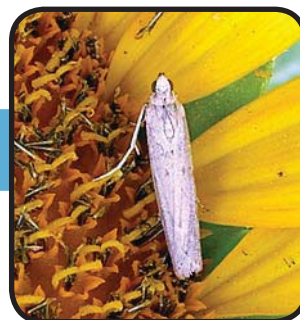
Figure 36. Sunflower moth adult - Homoeosoma electellum (Hulst)