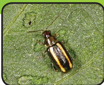
Figure 19. Palestriped flea beetle adult - Systema blanda (Melsheimer) (F. Peairs, Colorado State University, Bugwood.org)

Scouting Method: Surveys may be accomplished by using yellow sticky cards placed in between the rows and close to the ground. Sampling seedlings for beetles also can aid in estimating populations and feeding injury levels. Palestriped flea beetles move very fast and are hard to count directly on the seedlings or catch with an insect net. Control is recommended when 20 percent of the seedling stand is injured and at risk to loss due to palestriped flea beetle feeding. This economic threshold is a guideline based on published hail injury data that predicts potential yield loss relative to seedling stand loss. Research has shown that insecticide seed treatments may provide up to 75 percent control of adults.