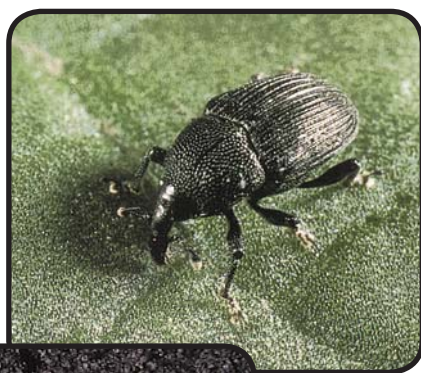
Figure 3. Sunflower root weevil adult - Baris strenua (LeConte) ( Extension Entomology )

Management: Decisions to use insecticides for wireworm management must be made prior to planting. No rescue treatments are available for controlling wireworms after planting. Producers have no easy way to determine the severity of an infestation without sampling the soil. Infestations vary from year to year. Considerable variation may occur both within and between fields. Sometimes the past history of a field is a good indicator, especially if wireworms have been a problem in previous seasons. Also, crop rotation may impact population levels. Two sampling procedures are available. One procedure relies on the use of a soil bait station trap of a corn-wheat seed mixture, which attracts wireworms. If the average density is greater than one wireworm per bait station, the risk of crop injury is high and an insecticide seed treatment or soil insecticide should be used at planting to protect the sunflower. If no wireworms are found in the traps, risk of injury is low. However, wireworms still may be present but not detected in the traps. The other sampling procedure involves digging and sifting a soil sample for the presence of wireworms. When digging soil samples, 12 or more wireworms in 50 3-inch by 3-inch (8 cm by 8 cm) samples is likely to result in damage to sunflower.