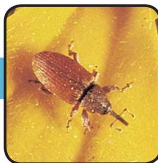
Figure 28. Red sunflower seed weevil adult - Smicronyx fulvus LeConte (Extension Entomology)

Damage: While the kernel of some seeds may be totally eaten, most seeds are only partially consumed. Larval feeding