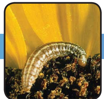
Figure 37. Sunflower moth larva - Homoeosoma electellum (Hulst) (Extension Entomology)