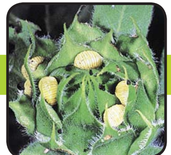
Figure 21. Sunflower beetle larvae - Zygogramma exclamationis (Fabricius) (L. Charlet, USDA-ARS)