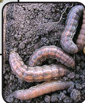
Figure 8. Redback cutworm larvae - Euxoa ochrogaster (Guenee)