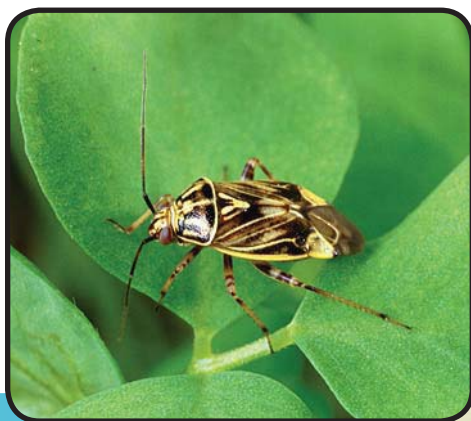
Figure 24. Tarnished plant bug adult - Lygus lineolaris (Palisot de Beauvois)

Management: Insecticide use generally has not been warranted for control of larvae. However, instances of high localized infestations can occur within certain fields and spot treating may be necessary. Disease outbreaks, indicated by dying larvae present on leaves, often occur when large populations are present. Sampling sites should be at least 75 to 100 feet (23 to 31 meters, or m) from the field margins when collecting data to determine whether an entire field should be treated. Infestations frequently will be concentrated in areas of a field where Canada thistle plants are abundant. Plants should be examined carefully for the presence of eggs and/or larvae. The economic threshold for the thistle caterpillar is 25 percent defoliation, provided that most of the larvae are still less than 1¼ inch (32 mm) long. If the majority of the larvae are 1¼ to 1½ inches (32 to 38 mm) long, most of the feeding damage already will have occurred and treatment is not advised.