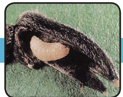
Figure 31. Gray sunflower seed weevil larva - Smicronyx sordidus LeConte