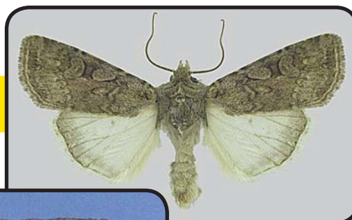
Figure 5. Darksided cutworm adult - Euxoa messoria (Harris)