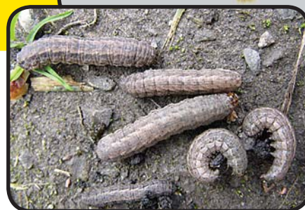
Figure 10. Dingy cutworm larvae - Feltia jaculifera (Walker)