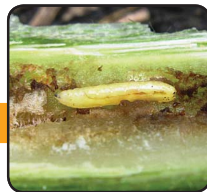
Figure 18. Sunflower maggot larva - Strauzia longipennis (Wiedemann) (J. Gavloski, MAFRI)