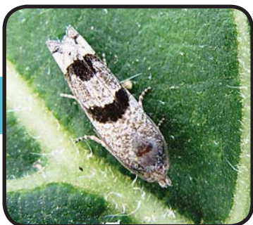
Figure 34. Sunflower bud moth adult - Suleima helianthana (Riley)

Management: In the central Great Plains, later plantings usually have lower infestations than earlier plantings. However, in other locations, planting dates have to be adjusted for conditions such as moth flight and length of the growing season. When necessary, a number of insecticides are registered for control of the sunflower moth in some regions. Scouting is most accurate in the early morning or late evening, when moths are active. Sampling sites should be at least 75 to 100 feet (23 to 31 m) in from field margins. The X pattern should be used in monitoring a field, counting moths on 20 heads per sampling site for a total of 100 heads. The economic threshold for sunflower moth is one to two adults per five plants at the onset of bloom (R5.1) or within seven days of the adult moth's first appearance. Sex pheromone lures are available commercially for monitoring with traps to indicate their arrival and to determine local populations. Insecticide applications should be considered when pheromone trap catches average four moths per trap per day from the R3 through R5 growth stages. Although the sunflower moth has numerous natural enemies, many attack only larvae in native sunflowers or related Asteraceae. Many of the natural enemies are generalists, and their preferred hosts are not associated with sunflowers. The dispersal of the moths over wide distances by wind may play a role in reducing the effectiveness of its parasitoids.