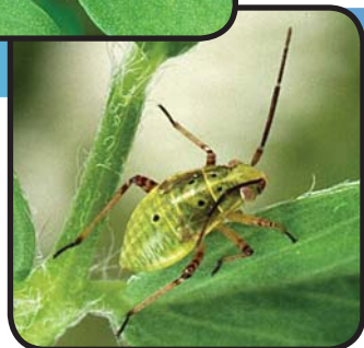
Figure 25. Tarnished plant bug larva - Lygus lineolaris (Palisot de Beauvois)