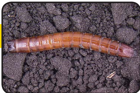
Figure 1. Wireworm – Elateridae

larvae may resume feeding nearer the surface, but the amount of injury varies with the crop. Wireworms pupate and the adult stage is spent within cells in the soil during summer or fall of their final year. Adults remain in the soil until the following spring.