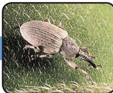
Figure 30. Gray sunflower seed weevil adult - Smicronyx sordidus LeConte (Extension Entomology)

Description: The gray sunflower seed weevil is found on sunflowers from Mexico to the Canadian provinces of Manitoba and Saskatchewan. It is more common in southern regions than the red sunflower seed weevil. Adults of the gray sunflower seed weevil (Figure 30) are slightly larger (9/64 inch