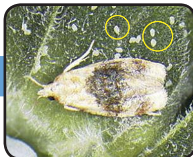
Figure 32. Banded sunflower moth adult and eggs (circle) - Cochylis hospes Walsingham (Extension Entomology)

Life Cycle: Banded sunflower moths begin to emerge from the soil about mid-July and are present in the field until mid-August. Moths spend much of their time in vegetation along field margins during the day. At twilight, females move into the fields to lay eggs. Within a week after emergence, they begin