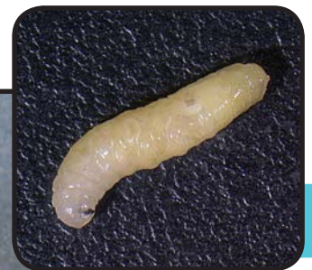
Figure 43. Sunflower seed maggot larva - Neotephritis finalis (Loew) (J. Knodel, NDSU)