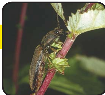
Figure 2. Wireworm adult (or Click beetle) – Elateridae