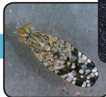
Figure 42. Sunflower seed maggot adult - Neotephritis finalis (Loew)