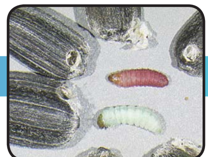
Figure 33. Banded sunflower moth larva - Cochylis hospes Walsingham (Extension Entomology)