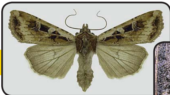
Figure 7. Redback cutworm adult - Euxoa ochrogaster (Guenee) (G. Fauske, NDSU)

Management: Sampling should begin as soon as sunflower plants emerge, and fields should be checked at least twice per week until approximately mid-June. A trowel or similar tool should be used to dig around damaged plants to determine if cutworms are present, since missing plants in a row do not necessarily indicate cutworm damage (gaps may be caused by a defective planter, poor germination, rodents or birds). The size of the cutworm larvae also should be estimated. Small larvae pose the greatest potential for damage because they still have to feed and grow. The economic threshold is one larva per square foot (30 by 30 cm) or 25 to 30 percent stand reduction. The Z pattern should be used to determine cutworm population levels by examining five 1-square-foot (30 by 30 cm) soil samples per site (in the row) for a total of 25 samples. Several different insecticides are registered for cutworm control in sunflowers. Postemergent treatment with an insecticide provides quick control of surface feeding cutworms. Best results occur if insecticide applications are made at night. Sunflower seed treated with an insecticide seed treatment will provide suppression only of cutworm activity.