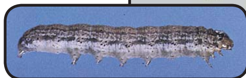
Figure 6. Darksided cutworm larva - Euxoa messoria (Harris) ( Extension Entomology )