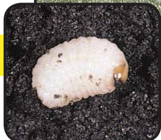
Figure 4. Sunflower root weevil larva - Baris strenua (LeConte) ( Extension Entomology )