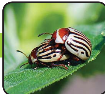
Figure 20. Sunflower beetle adults - Zygogramma exclamationis (Fabricius) (P. Beauzay, NDSU)

Life Cycle: Adults overwinter in the soil and emerge in late May or early June at about the same time sunflower seedlings emerge. Adults feed on the true leaves of young plants but seldom on the cotyledons. Adults feed during the day, whereas larvae are nocturnal feeders and congregate among the bracts of the flower bud and in the leaf axils during the day. Shortly after emergence, the beetles begin to feed, mate and lay eggs singly on stems and undersides of leaves. Adults live for about 8½ weeks and lay eggs for a six- to seven-week period. Each female lays approximately 850 eggs, with a range from 200 to 2,000 eggs. Larvae emerge in about one week. Larvae have four instars, which feed and are present in fields for about six weeks. When mature, larvae enter the soil to pupate in earthen cells. The pupal stage lasts from 10 days to two weeks. The late-summer population of adults emerge and feed for a short period on the bracts of the sunflower head or on the uppermost leaves of the plant before re-entering the soil to overwinter.