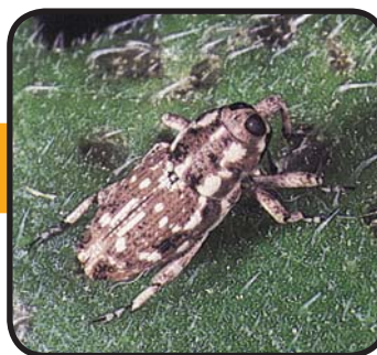
Figure 13. Sunflower stem weevil adult - Cylindrocopturus adspersus (LeConte) (Extension Entomology)