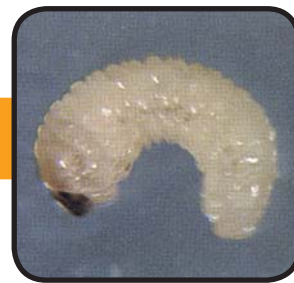
Figure 14. Sunflower stem weevil larva - Cylindrocopturus adspersus (LeConte) (Extension Entomology)