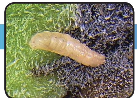
Figure 39. Sunflower midge larva - Contarinia schulzi Gagné