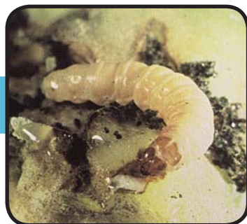
Figure 35. Sunflower bud moth larva - Suleima helianthana (Riley) (Extension Entomology)