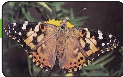
Figure 22. Thistle caterpillar (Painted lady butterfly) adult - Vanessa cardui (L.) ( Extension Entomology )

Damage: Larvae feed on the leaves and, when numerous, may defoliate plants. Larvae produce loose silk webbing that covers them during their feeding activity. Black fecal pellets produced by the larvae often are found in proximity to the webbing. The effect of defoliation by the larvae on the sunflower yield is similar to that described for sunflower beetle larvae.