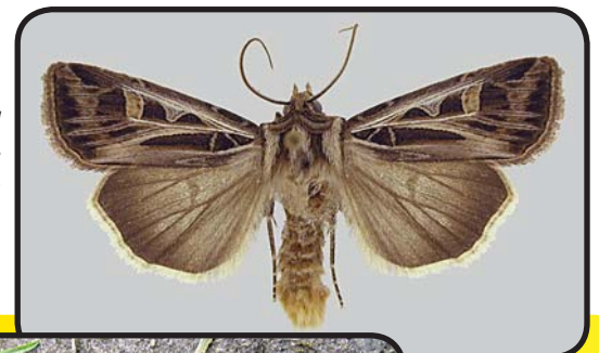
Figure 9. Dingy cutworm adult - Feltia jaculifera (Walker) (G. Fauske, NDSU)