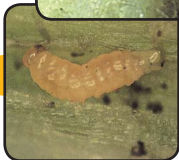
Figure 16. Black sunflower stem weevil larva - Apion occidentale Fall (Extension Entomology)