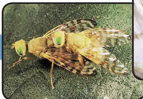
Figure 40. Sunflower receptacle maggot adult - Gymnocarena diffusa (Snow) (Extension Entomology)

Management: A field sampling protocol and an ET have not been developed for this insect because it is not of economic significance. Insecticide use has not been warranted for control of this fly.