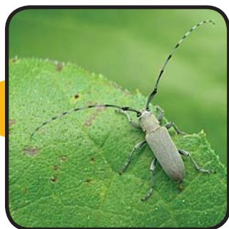
Figure 11. Dectes stem borer adult - Dectes texanus LeConte

Description: The sunflower stem weevil has been reported from most states west of the Mississippi River and into Canada. Adult sunflower stem weevils (Figure 13) are less than 3/16 inch (4 to 5 mm) long and grayish brown with white markings on the wing covers and thorax. The snout, eyes and antennae are black. The snout is narrow and protrudes down and backward from the head. Eggs are deposited inside the epidermis of sunflower stems. Eggs are very small (0.51 mm long by 0.33 mm wide), oval and yellow, and are difficult to see. Larvae (Figure 14) are 1/4 inch (6 mm) long at maturity. Larvae are legless and creamy white with a small, brown head capsule. They are normally in a curled or C-shaped position within the sunflower stalk. The number of larval instars appears to be variable and five to seven have been noted. Pupae are similar in size to the adult and are creamy white.