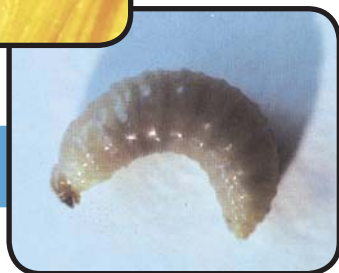
Figure 27. Sunflower headclipping weevil larva - Haplorhynchites aeneus (Boheman) (Extension Entomology)