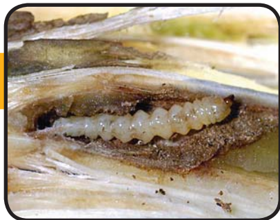
Figure 12. Dectes stem borer larva - Dectes texanus LeConte (P. Beauzay, NDSU)