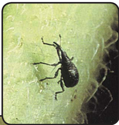
Figure 15. Black sunflower stem weevil adult - Apion occidentale Fall (Extension Entomology)

Management: This species, although numerous in cultivated sunflower fields, has not been considered an economically important pest. A scouting method has not been developed for black sunflower stem weevil, an economic threshold has not yet been established and recommendations for insecticidal control of this insect have not been developed.