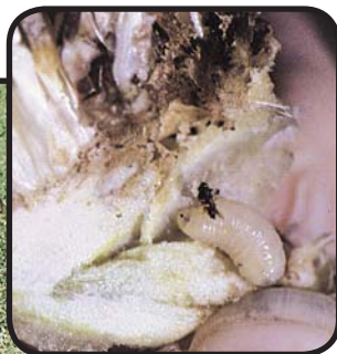
Figure 41. Sunflower receptacle maggot larva - Gymnocarena diffusa (Snow) (Extension Entomology)