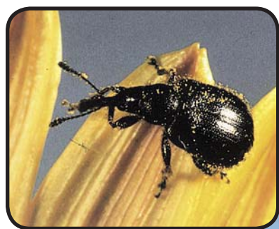
Figure 26. Sunflower headclipping weevil adult - Haplorhynchites aeneus (Boheman) (Extension Entomology)

Management: If the adults are encountered only periodically through scouting, controls should not be necessary, and to date no economic threshold has been established.