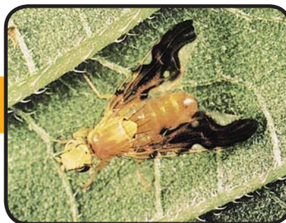
Figure 17. Sunflower maggot adult - Strauzia longipennis (Wiedemann) (Extension Entomology)