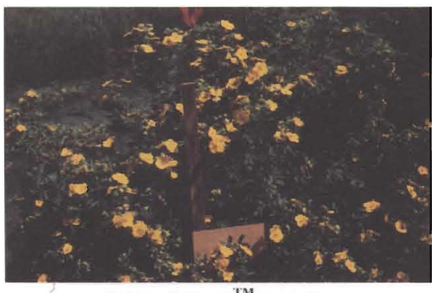
Dakota Goldrush TM potentilla.