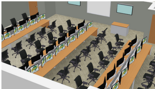
Rendering of the new commodity trading room in Richard H. Barry Hall.

The trading room will be used for teaching courses in agribusiness and the College of Business. Opportunities also will be explored through the Tri-College University system. There are plans to develop numerous outreach programs for individual firms, commodity organizations, Northern Crops Institute, biofuels sector and fee-based advanced programs.