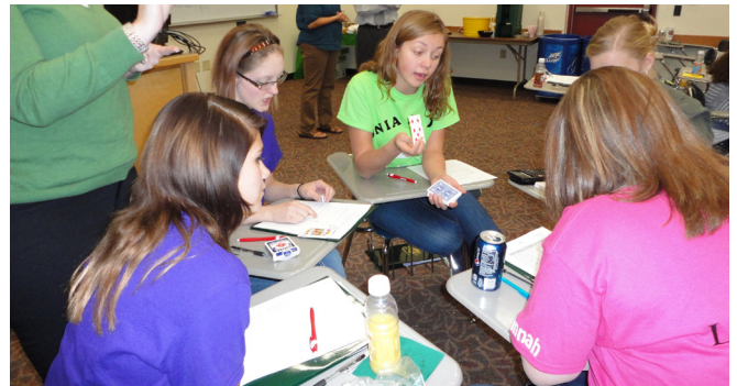
Students enjoy fun math activities during Sonia Kovalevsky High School Mathematics Day.

The NDSU mathematics department hosted the 16th annual Sonia Kovalevsky High School Mathematics Day Sept. 22. The event attracted 31 female students and eight teachers, the second highest attendance in the past six years.