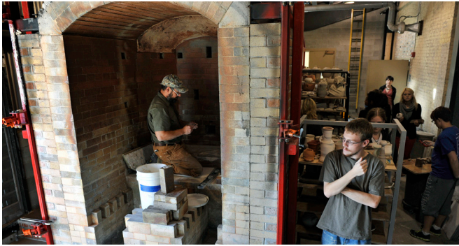
Faculty and students load the new wood kiln at NDSU's Renaissance Hall.

Faculty and students loaded the visual arts department's new wood kiln on Oct. 1 in preparation for its inaugural firing during NDSU's Homecoming, Oct. 1-6.