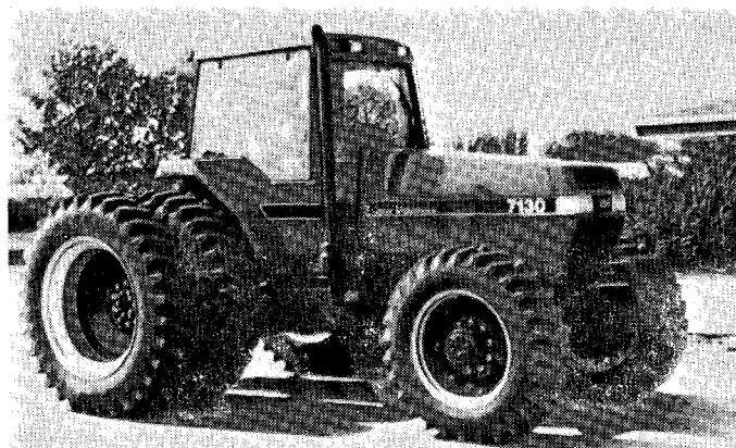
4WD and FWD tractors can reduce maximum axle loads over 2WD.